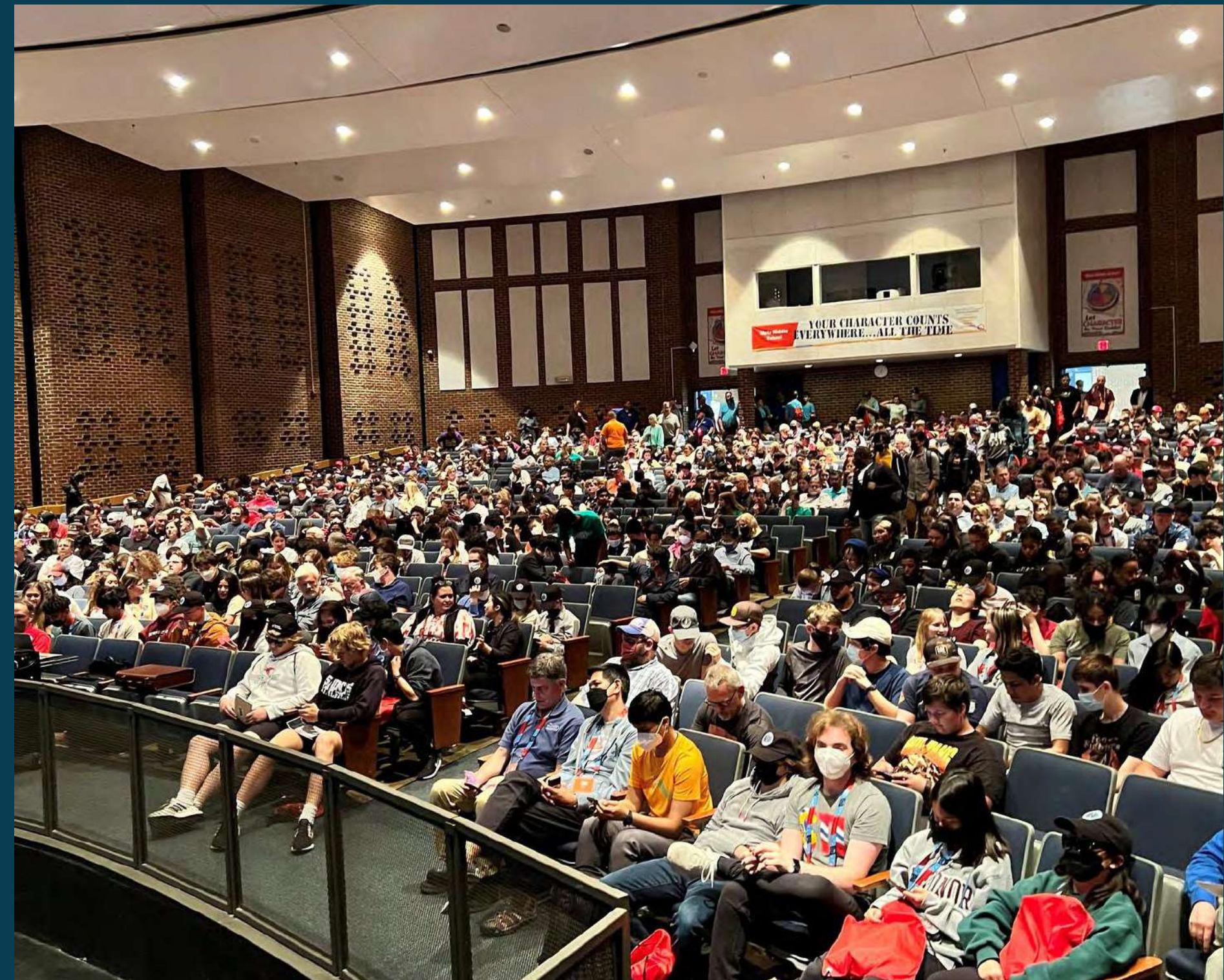
2022 Friday Night Pre-Finals All-Teams Gathering

The Finals will take place on Saturday, May 20, 2023, at the beautiful Great Meadow in The Plains, Virginia.